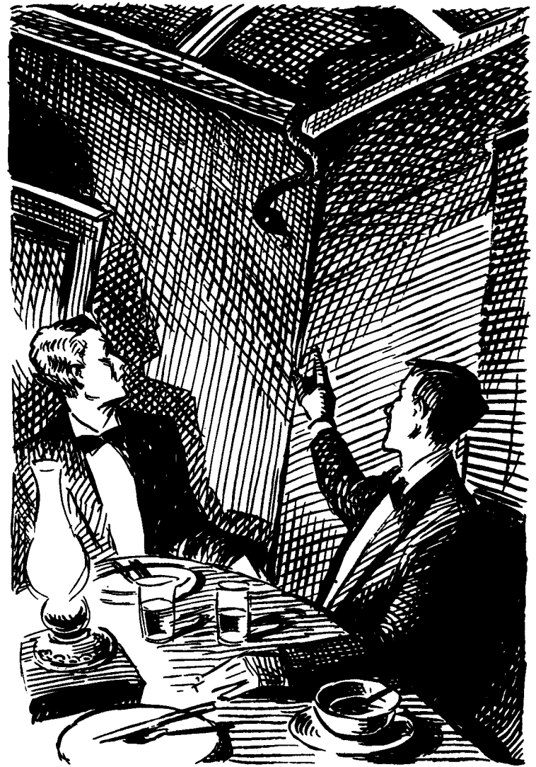
There was the head of a very dangerous brown snake, called a 'karait' in India, looking at us with cold eyes from a small door in the corner of the ceiling.

I turned and looked up. There was the head of a very