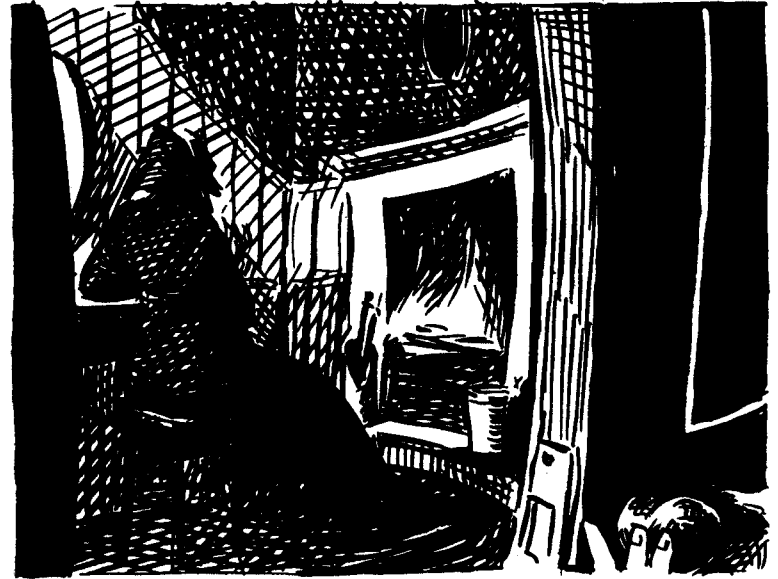
When I opened the door of my room, there was a woman sitting near the fire. She was about forty years old.

I cried out for help and soon Lord Glenfallen arrived. I ran out of the room as he ran in, and I waited outside to listen at the door. I did not hear every word but I knew that Lord Glenfallen was very