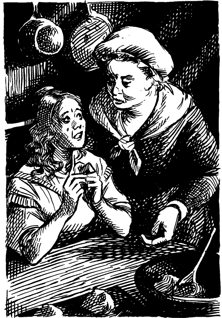
'The blind woman, the woman in the black coat, is dead. You saw her ghost. She was married to your husband and she was Lady Glenfallen.'

I am happy living here with my mother and father now. The house is quiet, I sleep well each night and they are friendlier to me than they were before. Sometimes my dead sister visits me at night, but I am never afraid. She tells me that the blind woman is trying to find me at Cahergillagh and that she wants to kill me. She is jealous of me; but she can never find me there. She must wait for the next Lady Glenfallen.