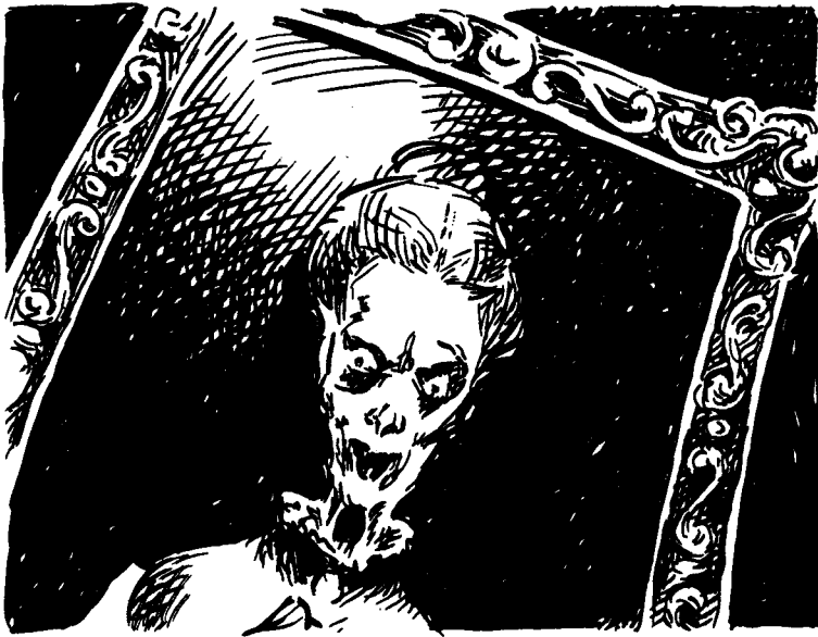
One picture was of Mrs Stone, old and with white hair, as she often was in my dream.

John Clinton came back to tell me dinner was ready. 'I don't like this picture, John,' I said. 'I'm going to have bad dreams tonight if it stays in here. Can we move it outside?'