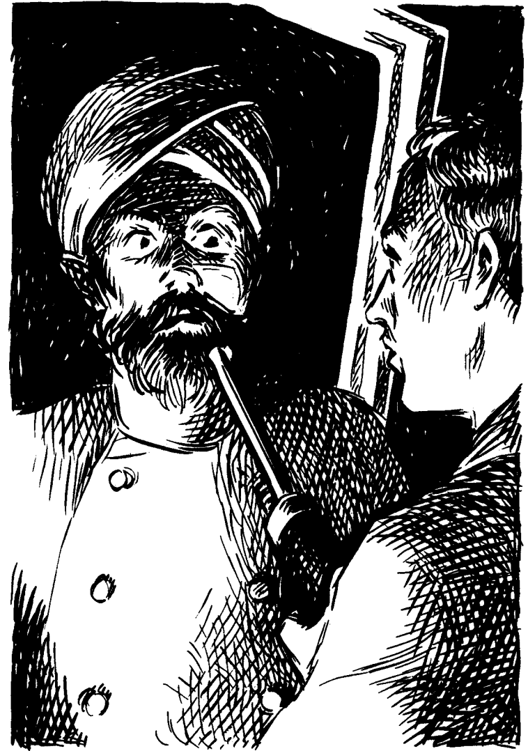
Strickland took his gun off the floor and stood up quickly. He pushed the gun into Bahadur Khan's face.

He moved back from the table and showed us his foot. There was the head of the brown snake, the deadly 'karait', with its teeth in his foot.