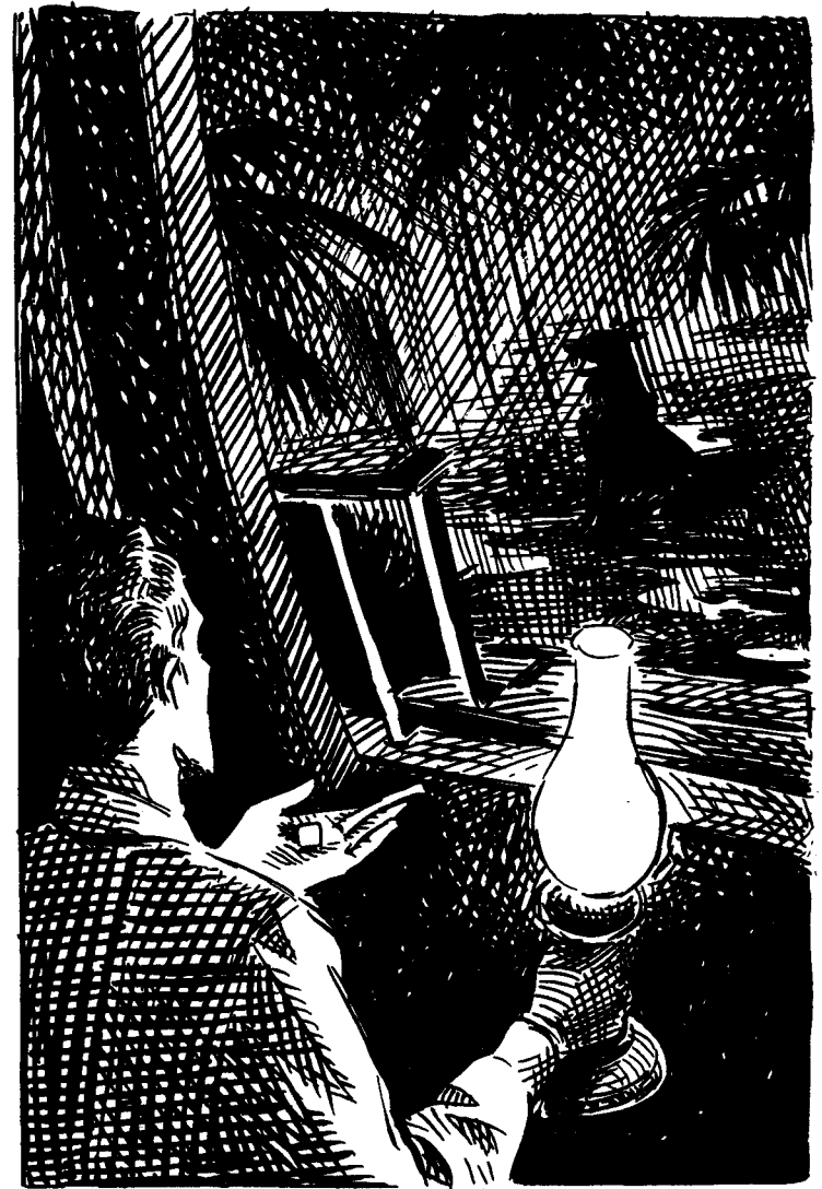
Tietjens was outside in the rain, very wet. Strickland called her again and again, but she did not want to come in.

The rain started and stopped again all night, but Tietjens stayed outside. She slept near my bedroom window and I heard her moving about. I slept very lightly and I had bad dreams. In my half-sleep I dreamt that somebody was calling to me in the night, asking me to come to them, to help them. Then I woke up, cold with fear, and found there was nobody there. Once in the night I looked out of the window and saw the big dog out there in the