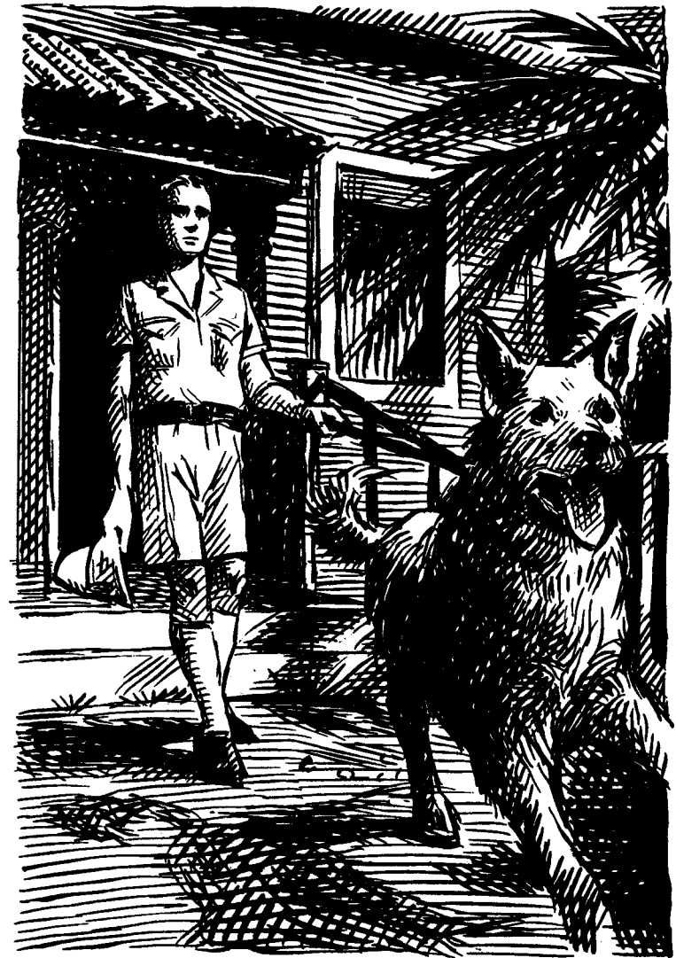
Tietjens always went to work with Strickland and often helped him in his police work, so the people of the town were quite afraid of her.

Imray's house stood unlive-in and quiet for three or four long, hot summer months. The hottest weather was finished when my friend Strickland, a policeman, moved to live in it. People said that Strickland was a very strange man but I always went to see him and have dinner with him when I was in the town working for a day or two. He had one or two other friends too; he liked his guns, he liked fishing and he liked his dog – a very big dog, called Tietjens. Tietjens always went to work with Strickland and often helped him in his police work, so the people of the town were quite afraid of her. Tietjens moved into the house with Strickland and she took the room next to Strickland's, where she had her food and where she slept.