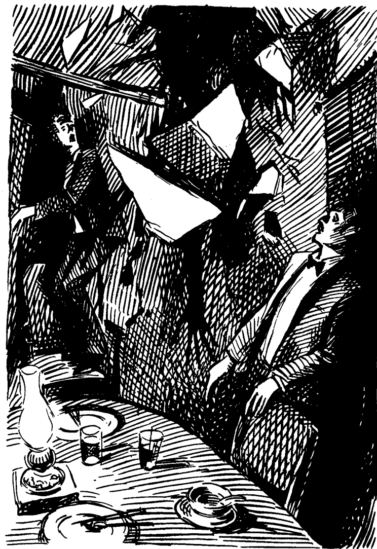
Something hit the centre of the ceiling hard from above, broke noisily through it into the room and hit the dinner table.

I jumped back. Something hit the centre of the ceiling hard from above, broke noisily through it into the room and hit the dinner table. It broke some glasses and plates on the table. There was water all over the floor. I went over with the light and looked down at the thing on the table. Strickland climbed quickly off